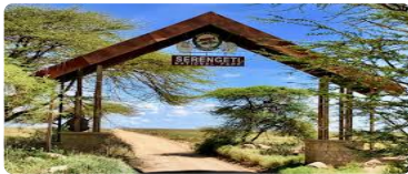
Serengeti National Park