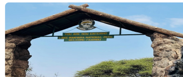
Lake Manyara National Park