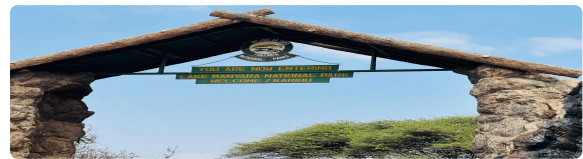
Lake Manyara National Park