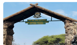
Lake Manyara National Park