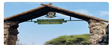
Lake Manyara National Park