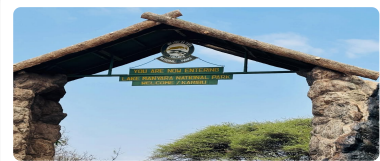
Lake Manyara National Park