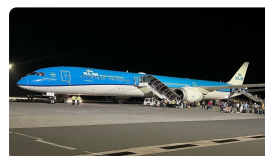
Kilimanjaro International Airport JRO