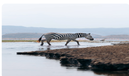
Ngorongoro Conservation Area