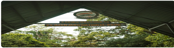
Kilimanjaro National Park